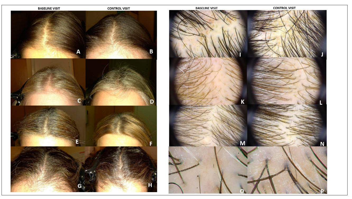
Figure 3. Comparison of clinical and trichoscopic images during baseline and control visit in patients with LED therapy. TE + AGA LED<sup>+</sup> group; B,D, J, L clinically presented regrowing hairs and increased number of thick hairs after 10 LED irradiation, compared to baseline visit (A,C, I, K); TE LED<sup>+</sup> (F,H,N,P) increased thickness and number compared to baseline visit (E,G,M,O)

TE – telogen effluvium; AGA – androgenetic alopecia; LED<sup>+</sup> – with LED therapy; LED<sup>-</sup> – without LED therapy